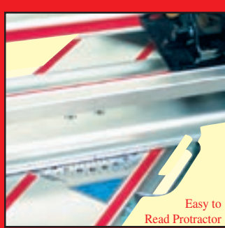
Easy to Read Protractor

Lock the saw track at precise angles using the easy to read built-in protractor. Precision cuts from 3/12 on up are as easy to setup and make as aligning the indicator with the preset pitch marks on the protractor. Built-in Vinyl bearing strips prevent wear between the components ensuring a long trouble free service life.