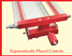
Ergonomically Placed Controls.

Van Mark gives you accessories you can really use. Material stops and extensions come standard.