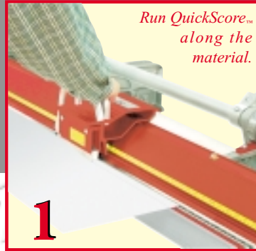
Run QuickScore™ along the material.