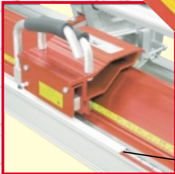
Automatically aligns material for true 180° hem after score.