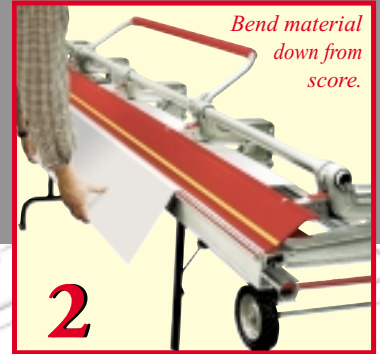
Bend material down from score.